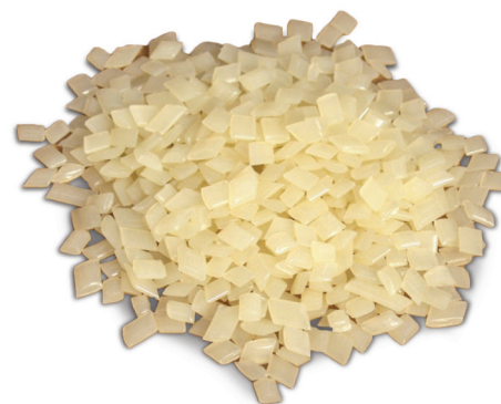
Hot melt granules in raw form