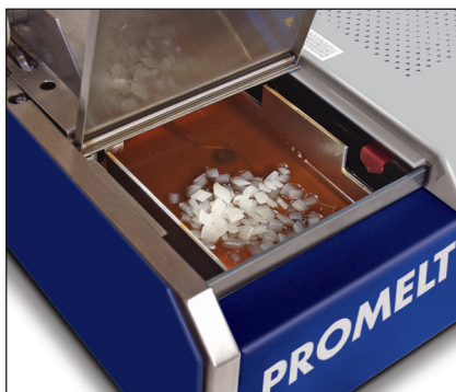
Open glue chamber