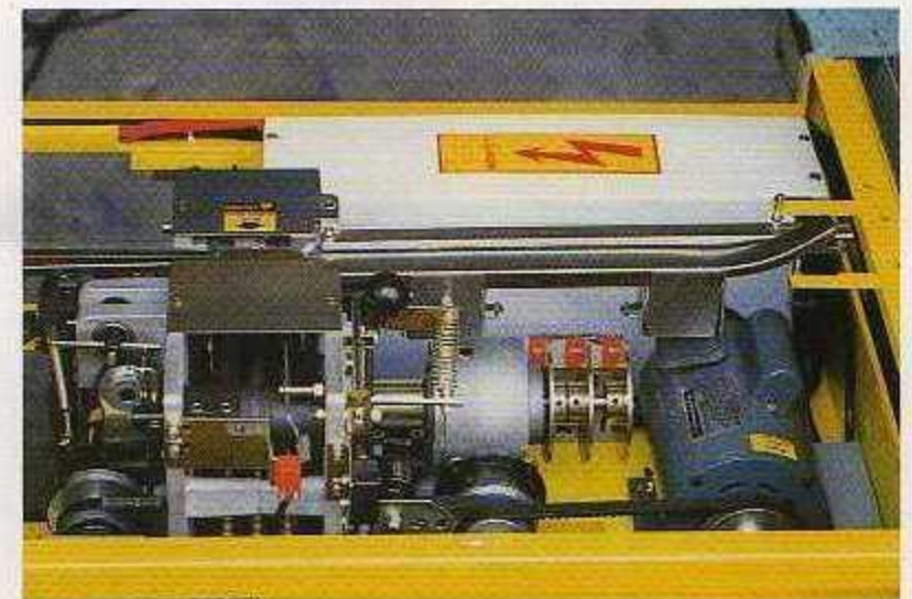
Heavy-duty mechanism construction